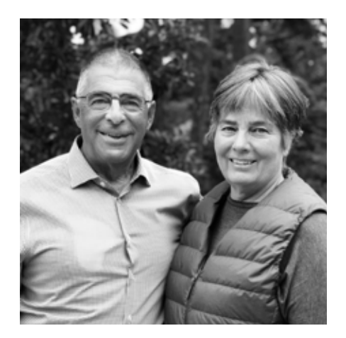
THE JOSEPH COHEN AND MARTHA FARISH NEW PLAY DEVELOPMENT FUND