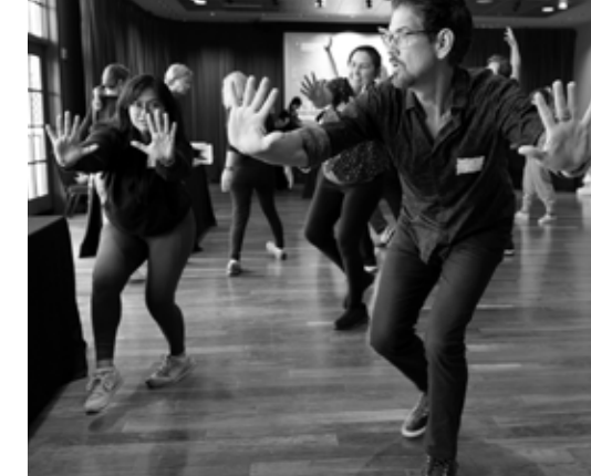
AXIS event Happy Birthday, Mr. Shakespeare!, 2023.